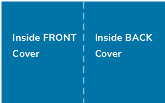
Full-Spread Ad (with bleeds) 17"w x 11.13"h

Bleeds are only allowed for full spreads, covers, and full-page ad placements.