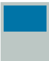
1/2-Page Horizontal 7.4"w x 4.75"h