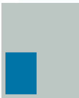
1/4-Page Vertical 3.58"w x 4.75"h