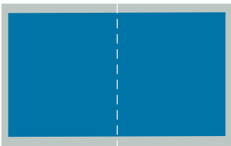
Full-Spread Ad (no bleeds) 15.65"w x 9.63"h